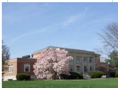
UConn @ Spring